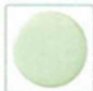
VERTICAL STRIPES CITRA LIME 2032-60 BENJAMIN MOORE