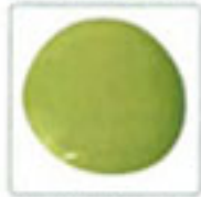
HORIZONTAL STRIPES PERENNIAL 405 BENJAMIN MOORE