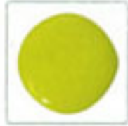
HORIZONTAL STRIPES NEW LIME 2025-30 BENJAMIN MOORE