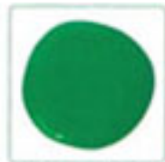
SMALL DINING ROOM GREEN MVS FINE PAINTS OF EUROPE