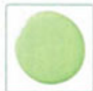
TASTY APPLE 416 BENJAMIN MOORE