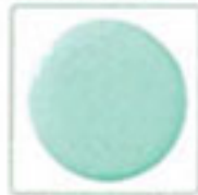
VERTICAL STRIPES WINTER GREEN 2045-60 BENJAMIN MOORE